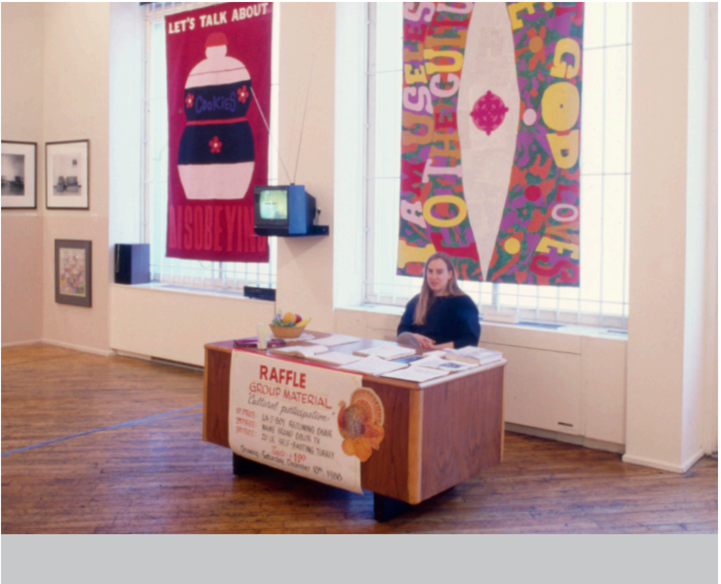
Group Material, "Democracy: Education and Democracy." Installation view, 77 Wooster Street, New York City, September 14 – October 8, 1988. © Group Material. Photo: Ken Schles