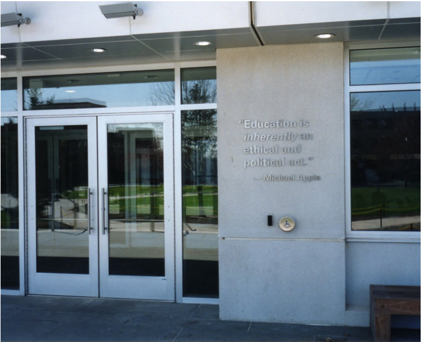
Julie Ault, "Points of Entry," 2004. Installation view.