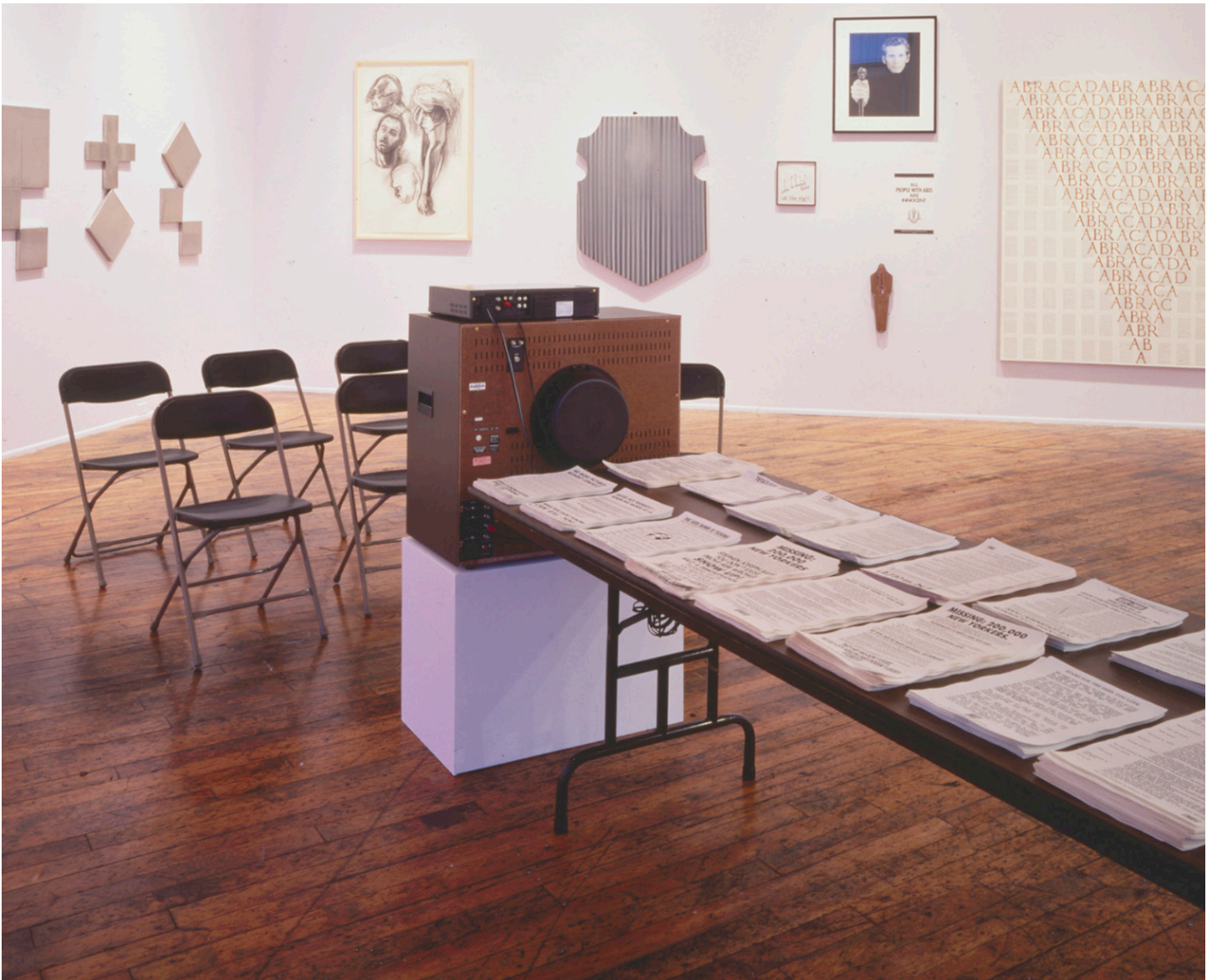
Group Material, "Democracy: Education and Democracy." Installation view, 77 Wooster Street, New York City, September 14 – October 8, 1988. © Group Material. Photo: Ken Schles