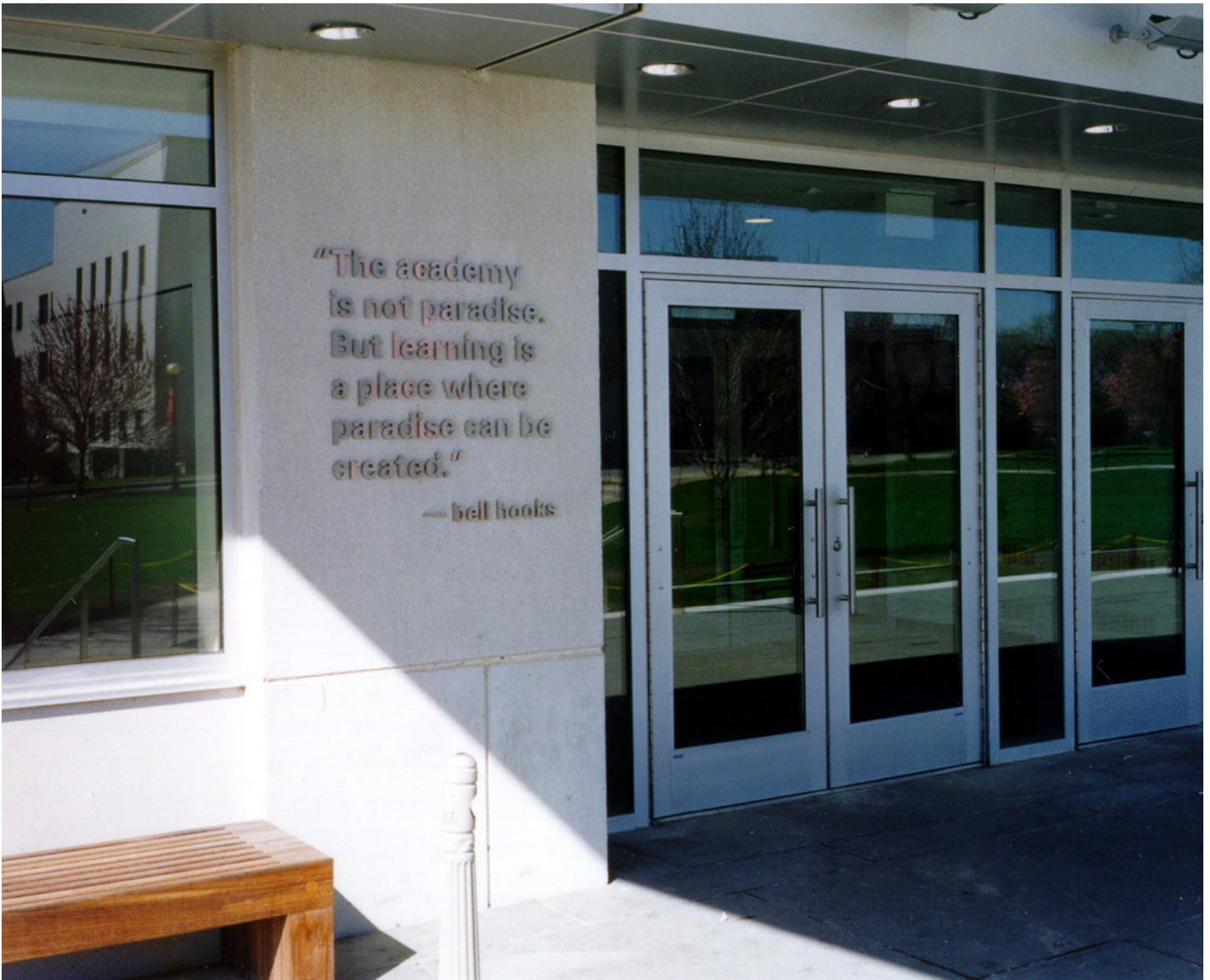
Julie Ault, "Points of Entry," 2004. Installation view.