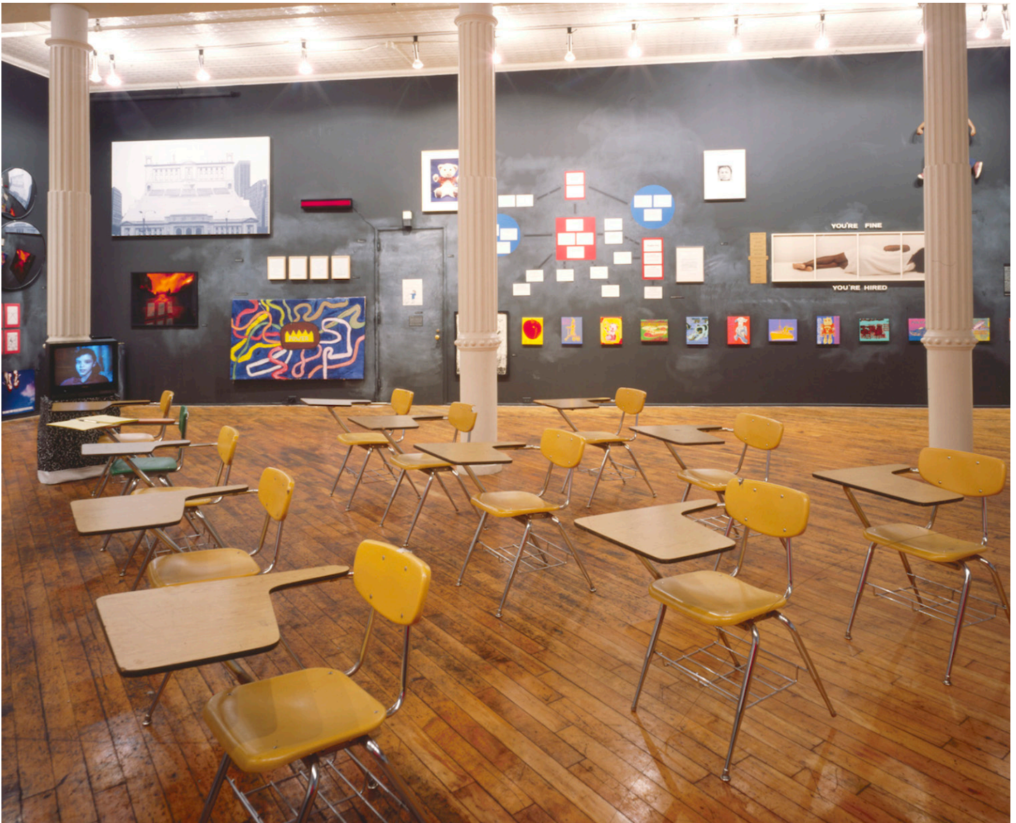
Group Material, "Democracy: Education and Democracy." Installation view, 77 Wooster Street, New York City, September 14 – October 8, 1988. © Group Material.